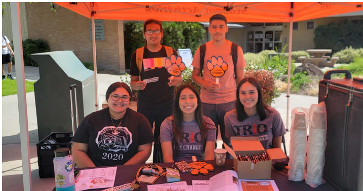
Student Ambassadors helped out during Opening Week