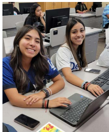
The RC Upward Bound program serves over 300 students per year.

RC cheerfully announces the refunding of our Upward Bound Program. This program was first funded, September, 1, 1992, and is celebrating its 30th Anniversary. Upward Bound first began serving 50 students from Reedley, Parlier, and Orange Cove High Schools.