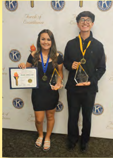
Torch of Excellence