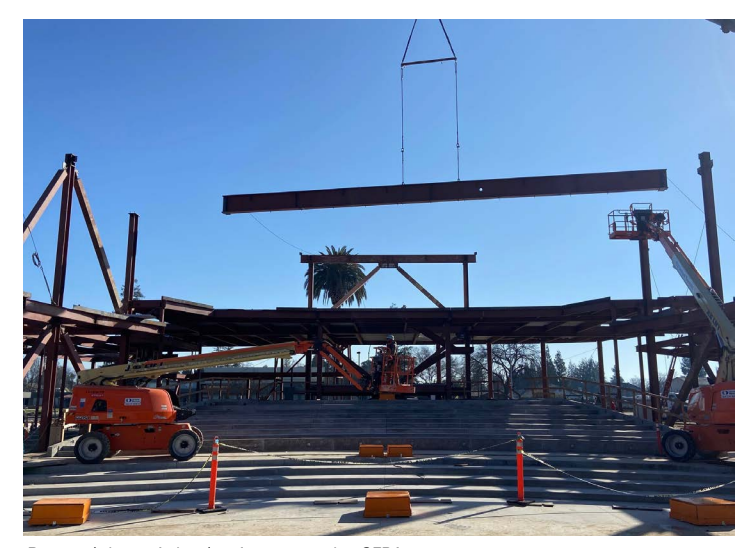
Beams (plate girders) going up on the CFPA.