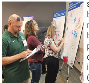
Community leaders provide input during a brainstorming exercise.

RC asked community leaders, faculty and staff to take a look into the future of the campus at a feedback forum July 17. Approximately 40 people took part in the forum, recommending which programs we