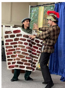
Pyramus and the "Wall."

Fun and plenty of laughs were had at a special showing of A Midsummer Night's Dream in front of a packed Forum Hall March 2. The San Francisco Shakespeare Festival gave an excellent/dizzying/magical performance with just five actors. If you know the play, it is full of fairies, a foolish acting troupe, a complicated love triangle and enough physical comedy to make the most unbelieving fall in love with Shakespeare. Pyramus, played by Bottom, stole the show with his elaborate and over the top death. Others insisted that Puck (dressed in fox ears and a tail) and Titania (the fairy queen with moxie for days) were the stars of the evening. Midsummer is one of Shakespeare's most popular plays and is widely performed. Admission was free.