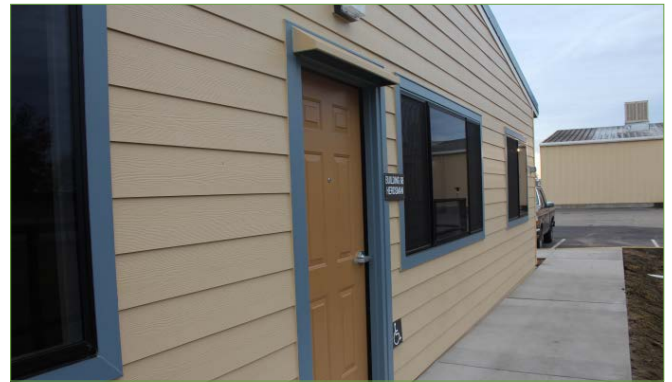
Four students will occupy the Reedley College Herdsman Housing unit beginning early next year.

Furniture has been ordered for the Herdsman Housing, a home that will house students who work on the campus farm in exchange for residency. The Herdsman Housing is a new four-room residence that is located at the southern end of the campus directly east of the pavilion building. A ribbon-cutting ceremony for the Herdsman Housing will be held in January.