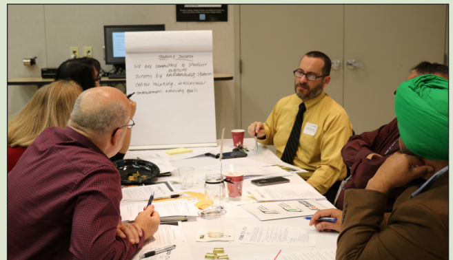
Community members, faculty, staff, and administrators collaborated on the Strategic Plan during one of the Community Feedback Forums held in Madera on January 24.